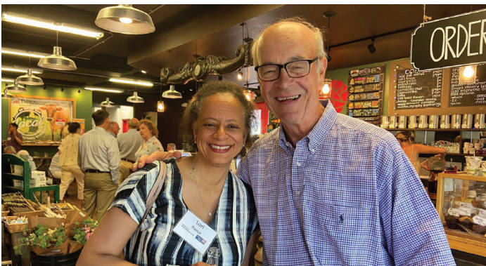
Thank you Tocqueville members, who gathered in person once again to celebrate our community and Tocquevilles' impact, hosted by Argus Farm Stop.