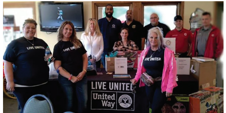
Labor/Management Golf Outing: Annual Fundraiser for United Way