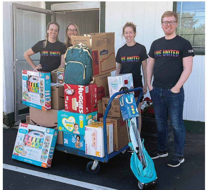
Thank you Emerging Philanthropists, for dropping off more than 6,000 items donated during the Community Baby Shower and delivering them to SOS Community Services, Destiny and Purpose Community Outreach (DAPCO) and Saline Area Social Services.

*For more information about G A V E Community Centric Fundraising