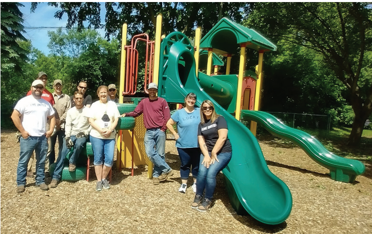
National Day of Action: Foundations Preschool Playground Cleanup