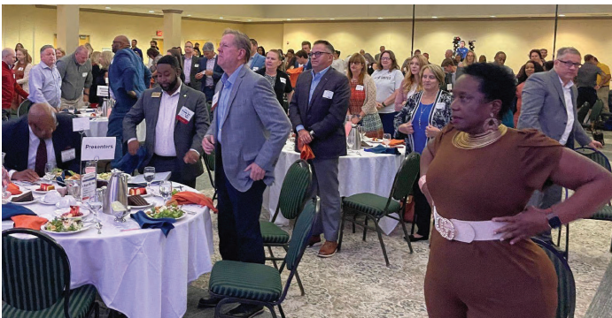
Thank you to the 200+ guests who attended our Campaign Kickoff event at Eastern Michigan University. Our first major in-person event since the 2020 pandemic!