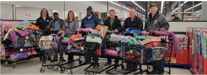
Labor of Love: Annual Gift Drive to support children during the holiday.