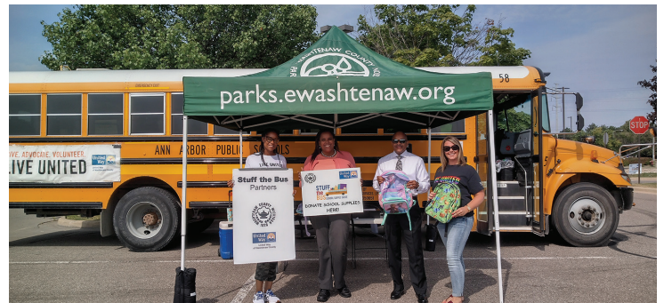
Stuff the Bus: Annual School Supply Drive