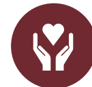
UNITED WAY LIFE